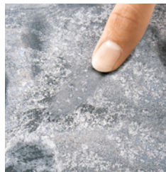
Dirt and limescale adhere more easily to conventional ceramics.