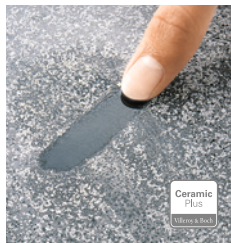
CeramicPlus makes it very difficult for dirt to adhere. Easy cleaning, even with dried-on limescale.