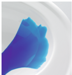
Flow properties of liquids on a conventional ceramic surface.