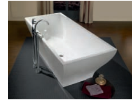
La Belle bath