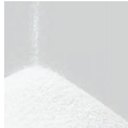
The basis: 60 % pure, fine-ground quartz powder