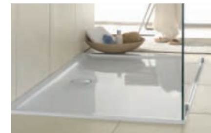
Futurion Flat shower tray