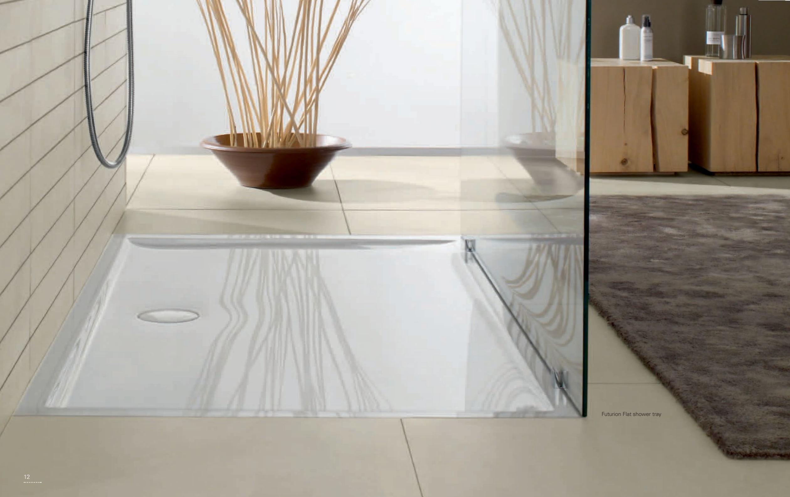
Futurion Flat shower tray