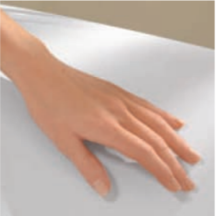
Smooth, pore-free surface

Quaryl® products also have slip-resistant properties. This creates a feeling of safety.