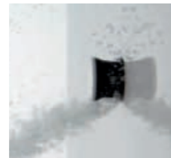
Invisible Jets pop-up side jets