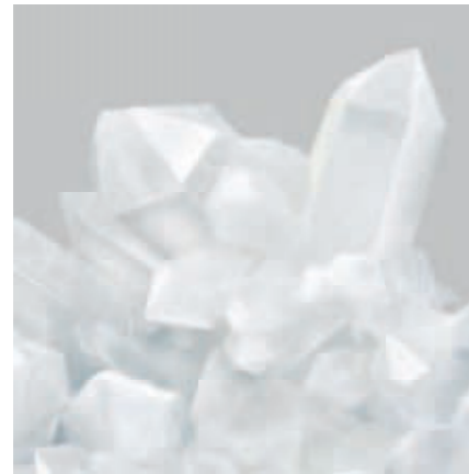
It all starts with quartz crystal

The unique liquid mixture comprising 60 % quartz and high-quality acrylic resin can be moulded into any form using a high-precision casting method for the manufacture of Quaryl® products. The resulting Quaryl® is a unique material with a thickness of up to 18 mm. Thanks to its durability, Quaryl® has provided a successful foundation for numerous product and design innovations for years.