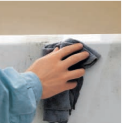
Easy to clean